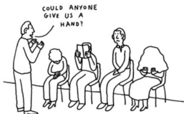
IT IS DIFFICULT TO HIDE WHEN A VOLUNTEER IS REQUIRED