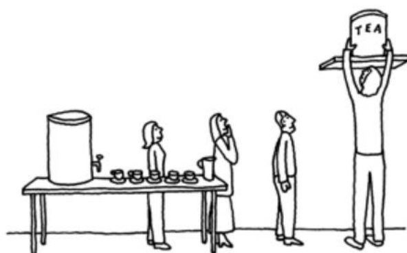
BEING ASKED TO RETRIEVE THINGS FROM HIGH SHELVES